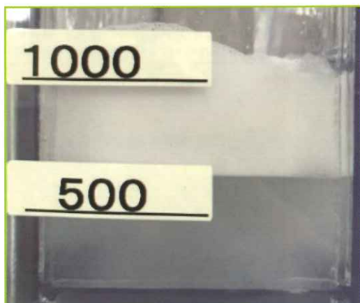
従来浴 Conventional bath