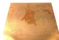
従来浴 Conventional bath