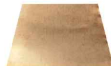
ICPクリーンR5 ICP CLEAN R5